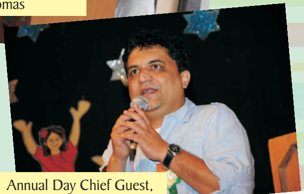
Annual Day Chief Guest, Mr. Swanand Kirkire